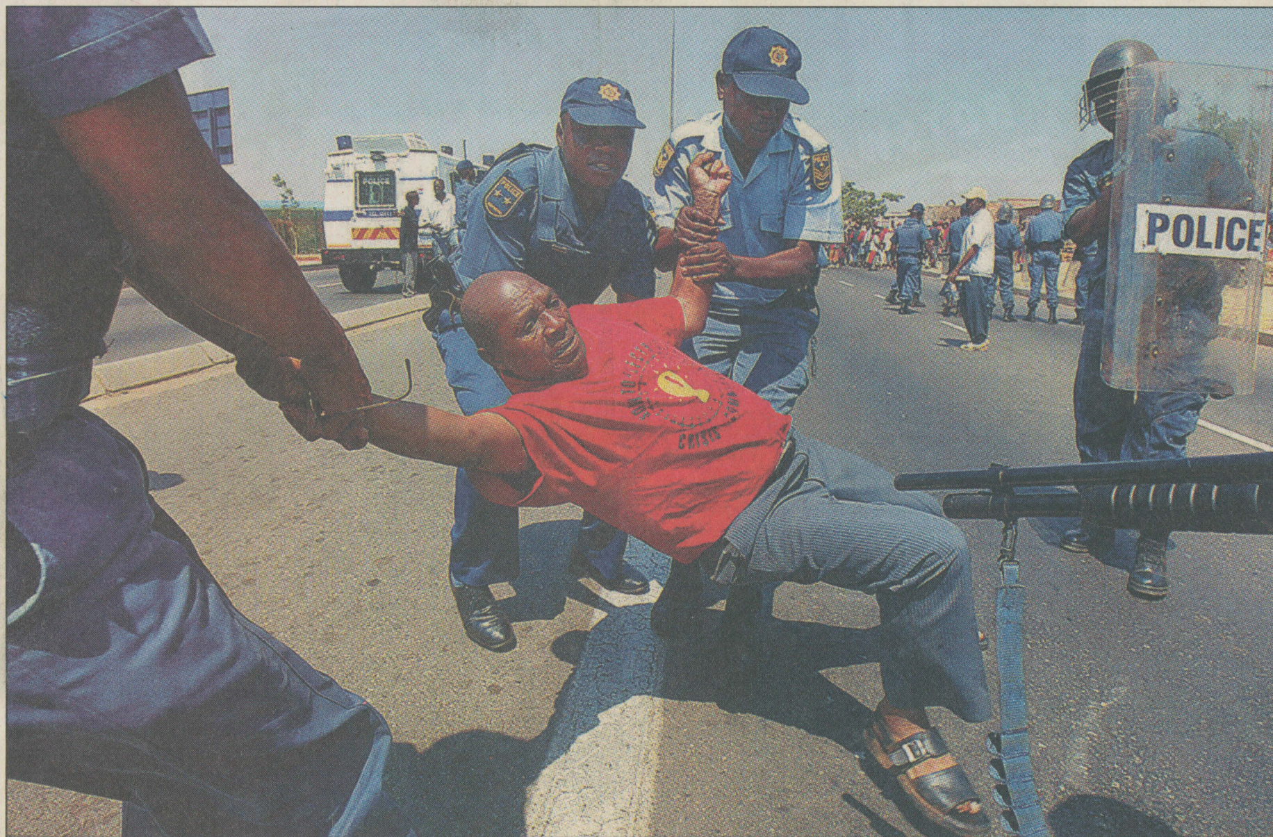
STRONG ARM: Police carry a protester off the Old Potchefstroom Road in Soweto yesterday during a demonstration against the installation of prepaid water meters.