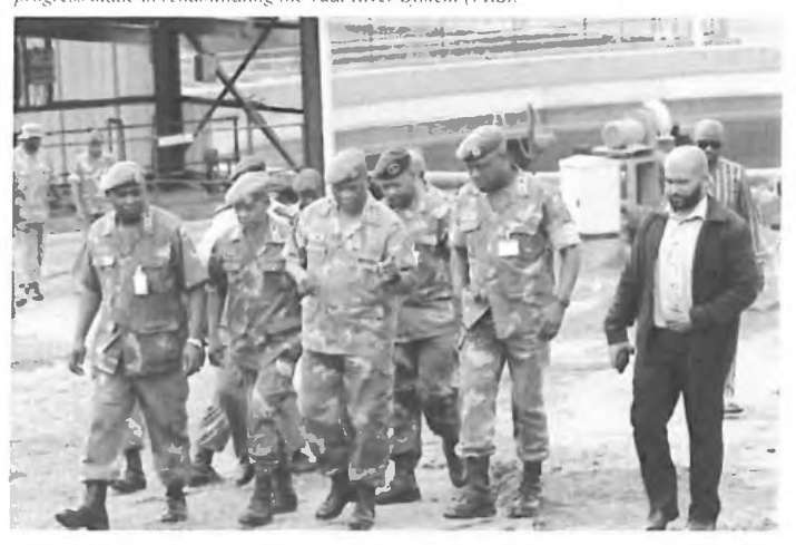
Lieutenant General Lindile Yam (centre) is surrounded by fellow troops during his visit to the Sebokeng Waste Water Treatment Works

THREE months into Operation Vaal River, army engineers and troops have made significant progress in rehabilitating the Vaal River System (VRS).