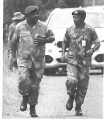
Some of the scenes outside the Vanderbijlpark municipal water reservoirs where soldiers welcomed their Army Chief, Lieutenant General Lindile Yam