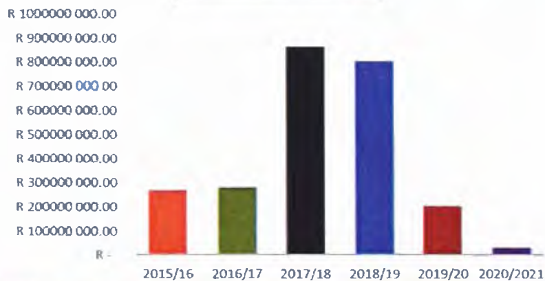
Annual Cash Flows