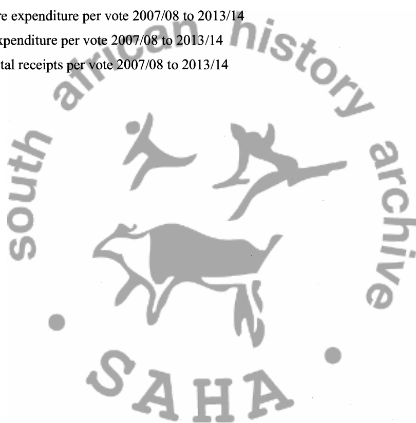
Table 10: Departmental receipts per vote 2007/08 to 2013/14

Table 9: Personnel expenditure per vote 2007/08 to 2013/14