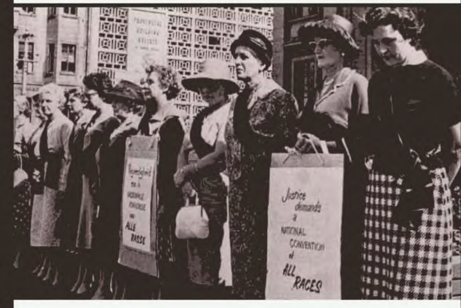
BLACK SASH DEMONSTRATORS HOLD PLACARDS READING, JUSTICE DEMANDS A NATIONAL CONVENTION OF ALL RACES.

You would recruit who he recruited - he brought him to us - it was left to us again to tell the people that : listen, there are South Africans here - and they all knew, those who we recruited - there was of course the difficulty that at one - one or two places, each time we got there the - the - the contact was already in prison - he was in detention in - in - in longuarings, you see, so things would be - things would be a bit award at that time, because now we would have to go back to another one somewhere, perhaps a person you had already - invariably a person we would already have had contact with - go to him to use him in this particular area where the contact is agrested, so you know, and ask him to - to go there and seek for Zapu people he know.